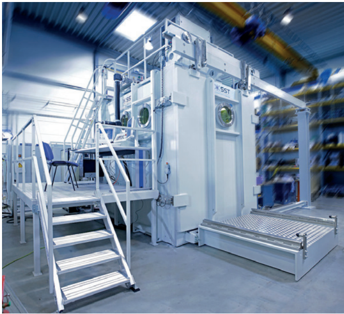
Modern universal electron beam machine from Steigerwald Strahltechnik.