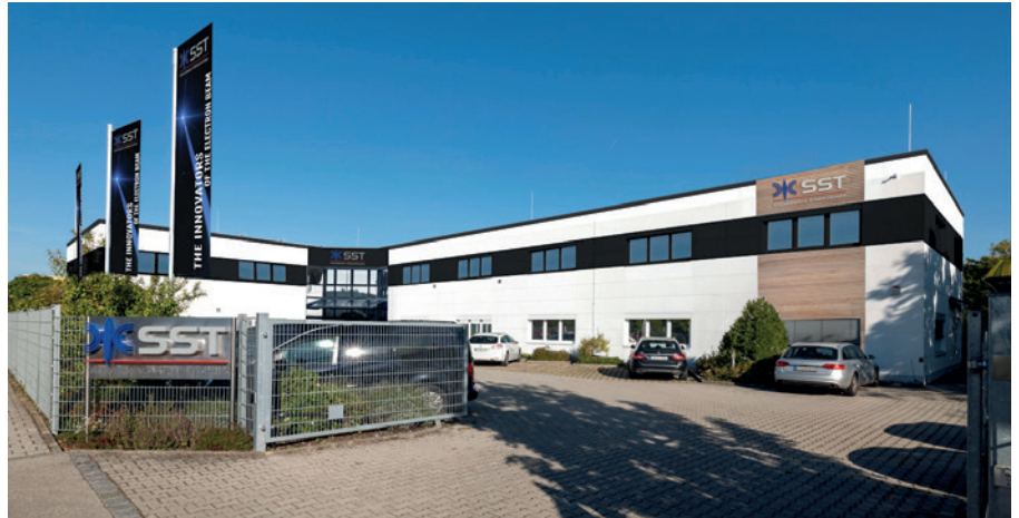
Steigerwald Strahltechnik GmbH business premises in Maisach near Munich, Germany.

The GBT Group employs more than 860 people at over 30 locations worldwide and is represented in 55 countries. The annual turnover amounts to around € 175 million. Steigerwald Strahltechnik GmbH's global presence in sales and service and